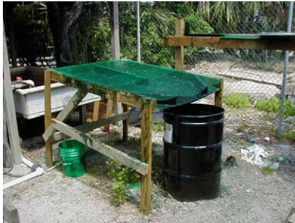
Recapturing drip loss and preventing spills protects the environment and saves money.

cleaning of bio-fouled equipment may not occur over sovereign submerged lands.