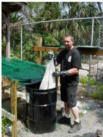
Follow manufacturer recommendations for adequate ventilation and protective gear.

coatings or coated equipment to Florida clam farmers are encouraged to apply and demonstrate to the Division that fully cured coatings will not release pollutants to Florida waters. Please submit a request to Mark Berrigan, 850-488-4033 or berrigm@doacs.state.fl.us .