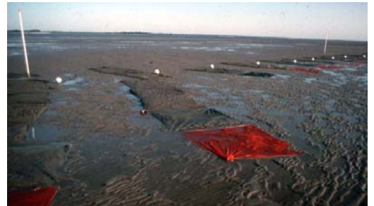
Low tide briefly exposes an array of planted clam bags.

Hard clam farmers use submerged state lands to plant their crops and take advantage of Florida's coastal waters that are rich in phytoplankton. These microscopic plants are a natural and abundant food source for clams, oysters, mussels and scallops. Farm-raised hard clams are usually enclosed in polyester mesh bags that are secured to the bottom. The bags conveniently containerize the clams for ease of handling and protect them from a variety of predators. Sediments naturally filter through the mesh and the clams dig down into the bottom for protection. To feed, clams push their siphon up through the mesh to filter out phytoplankton, dissolved organic matter, and organic particles.