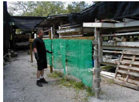
Coated equipment must be fully cured to an inert condition.

equipment or installing coated equipment on sovereign submerged lands must contact the Division for permission to do so.