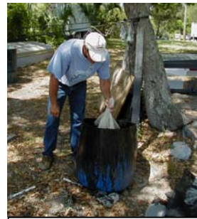
Some farmers coat the side of a clam bag exposed to predators.

rolled out over the clam bags as cover netting to increase protection. Purchasing, handling, installing, and removing cover netting increased production costs. To reduce cost and effort, farmers attached grow out bags to chicken wire and rolled out cover netting and grow out bags in one step. However, the quality of chicken wire has declined and cost increased.